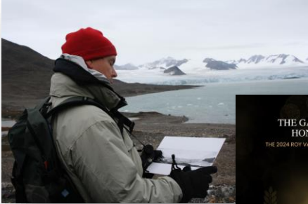
HSH Prince Albert in Svalbard.