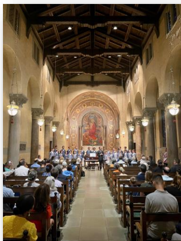
St. Barts Church, New York