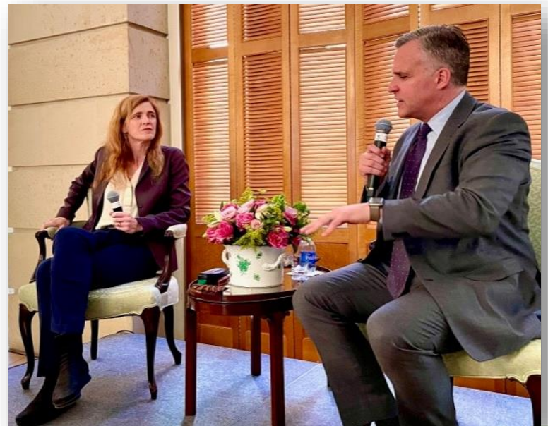
Above: USAID Administrator Samantha Power with (former) Chief of Protocol Rufus Gifford.

The Administrator outlined many of the top priorities of the Biden-Harris administration for USAID at the well-attended talk and reception held in Washington, D.C. in late March.