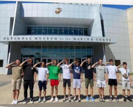
Visiting the National Museum of the Marine Corps