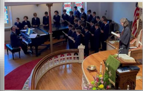
Wesley Monumental United Methodist Church, Savannah GA