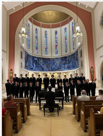
Cathedral of St. Mary, Miami FL