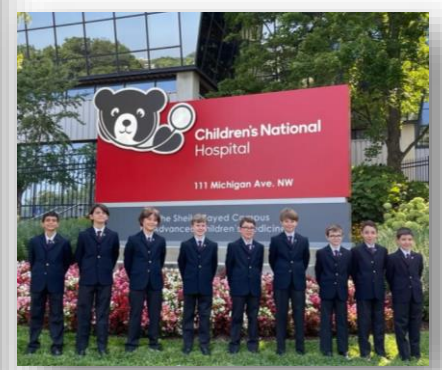
Outside Children's National Hospital, Washington, D.C.