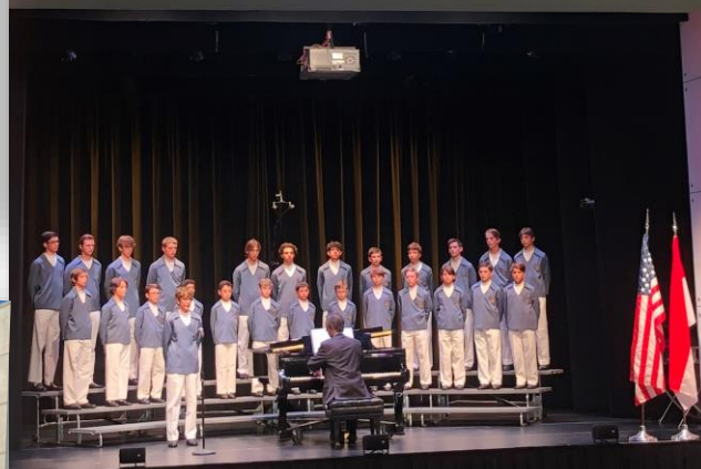
On the Kennedy Center's Millennium Stage, Washington, D.C.