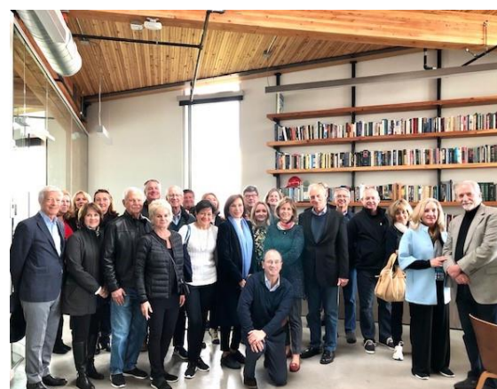
Honorary consuls join Earth Day founder, Denis Hayes, at the Bullitt Center