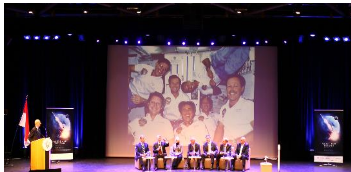
Above: 2018 PIOT event at Monaco’s Grimaldi Forum; Right: NatGeo’s “APOLLO” poster, 2019

Initiated in 2016 by the Embassy of Monaco in Washington, D.C., this forum, held under the High Patronage of His Serene Highness Prince Albert II, on the future of space exploration underscores the Principality’s historical interest in aviation, aerospace technology and exploration. Past panelists and guests have included NASA-trained astronauts from the USA, Canada, and Europe; industry leaders in space and aerospace technology; expert scientists; and award-winning film makers. The format includes a documentary film with space as its central theme (past examples are “The Last Man on the Moon,” “Above & Beyond: NASA’s Journey to Tomorrow,” “APOLLO Missions to the Moon”), followed by a panel discussion featuring experts (astronauts, scientists, film makers). The discussion is recorded, streamed live, and promoted on social media. The event is free and open to the public, with advanced reservation. For information on previous editions, please visit: monacoeventsusa.com .