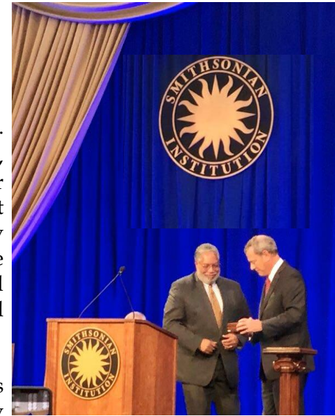
From left to right: Mr. Lonnie G. Bunch III and Chief Justice John G. Roberts

Prince Albert for the opening ceremony of the "Antarctica Treaty Summit," held at the National Museum of Natural History, a Memorandum of Understanding was signed between the Foundation and the Institution in recognition of their shared objectives and interests in science, environmental protection, and sustainable development.