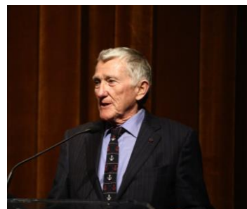
The Hon. John Lehman, Princess Grace Foundation-USA at MPA