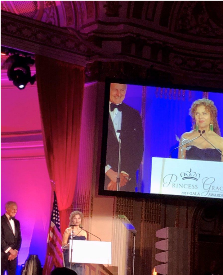
Above: Mr. Victor Garber and Ms. Bernadette Peters onstage at The Plaza Hotel;

The winner of the 2019 coveted Prince Rainier III Award for highly successful artists who have made significant humanitarian contributions, is Broadway legend, Bernadette Peters.