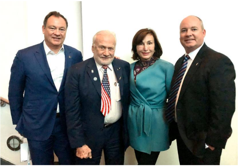
Bottom: Blue Origin’s Blue Moon lander on display at the IAC