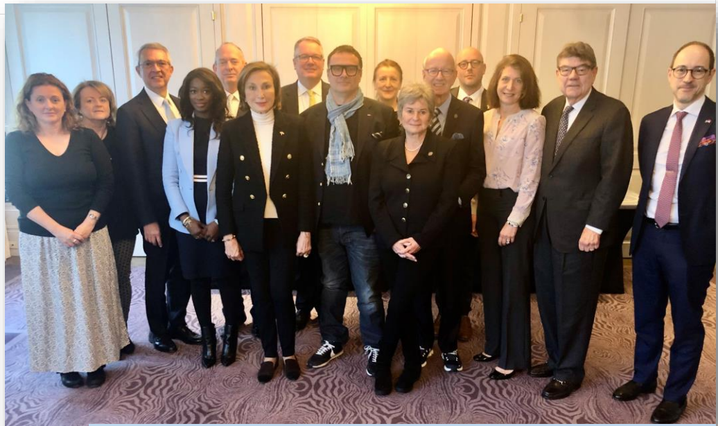
Above: Members of Monaco's consular community in the USA.