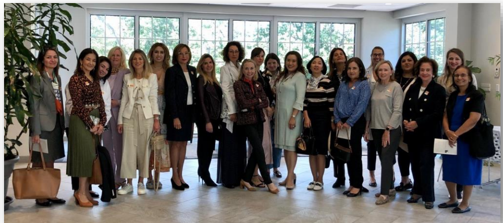
Right: Members of the International #1 Club gather for a private tour of the Grace of Monaco : Princess in Dior exhibition at Hillwood Estate.