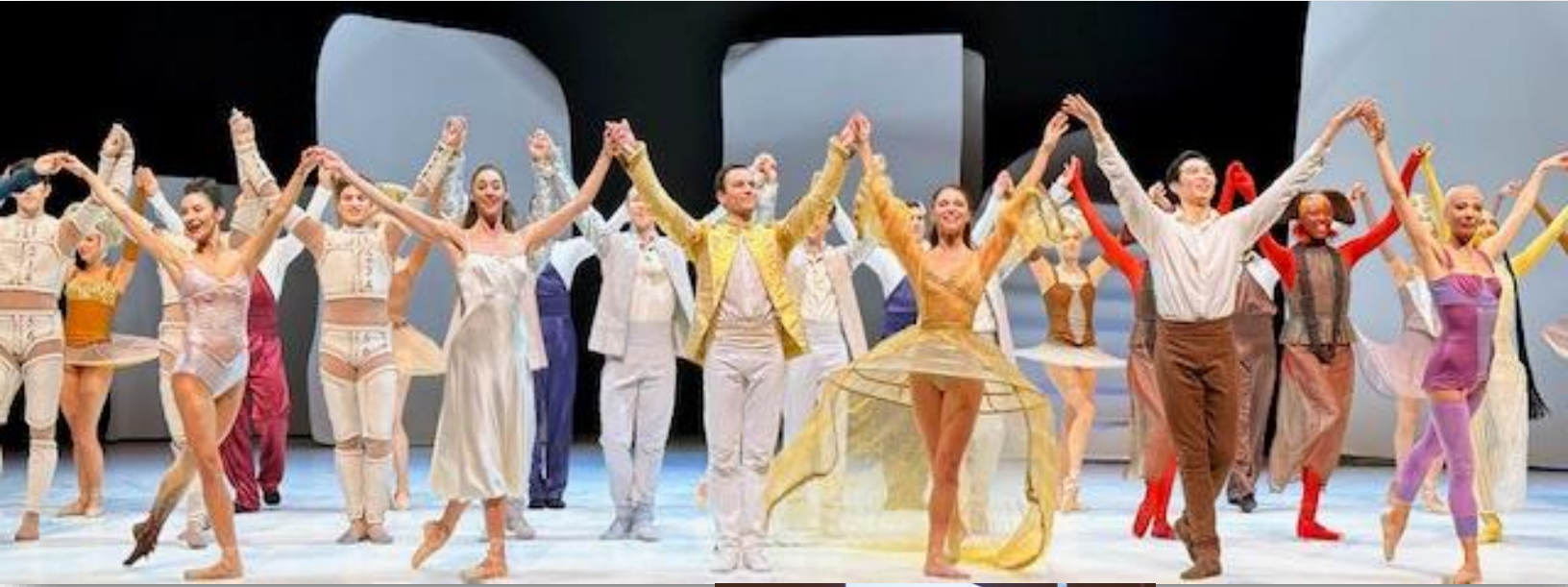
Take a bow, Les Ballets de Monte-Carlo!