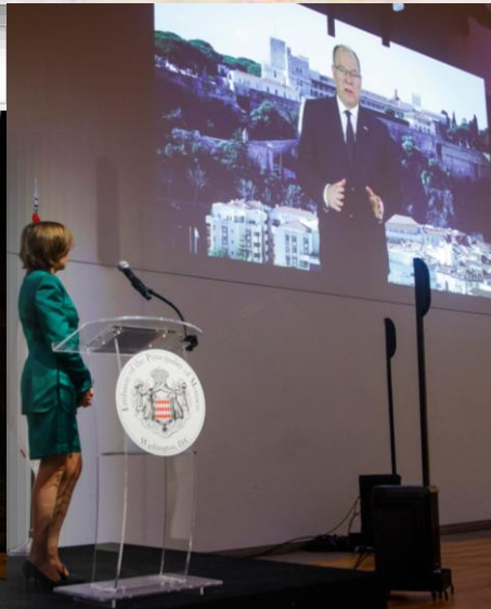
Left: H.S.H. Prince Albert's address at Les Ballet's soiree on Monaco's National Day; Below: members of Les Ballets and guests at the farewell reception following their triumphant performances at the Kennedy Center in November.