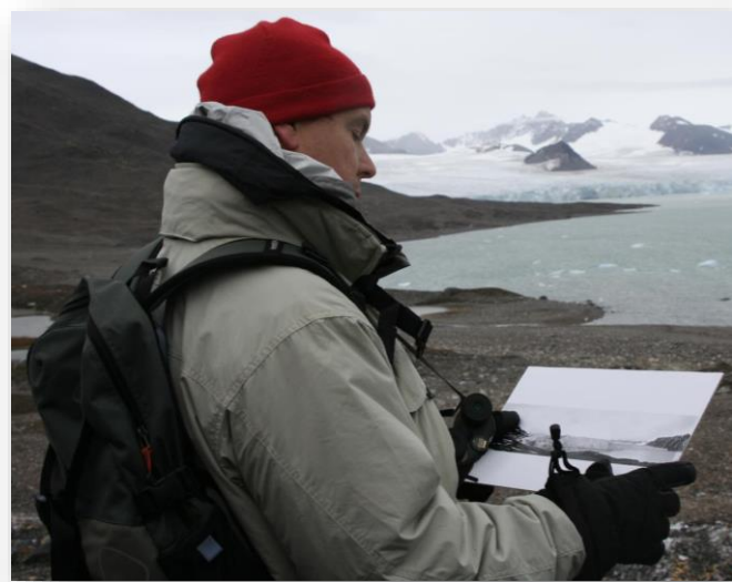
Above: H.S.H. Prince Albert in Svalbard Bay in 2005

Here is an excerpt from Prince Albert opinion piece: