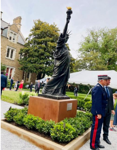
Above: 'Little Sister' Liberty in the front garden at the French Ambassador's residence in Washington, D.C.

This year, the famous Statue of Liberty National Monument in New York Harbor was joined by one of her little 'sisters' at the annual Independence Day celebrations in New York City, and soon afterwards, the smaller Lady Liberty was trekked down to Washington, D.C.