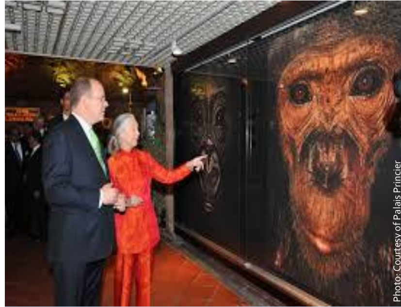
Above: H.S.H. Prince Albert with Dame Jane Goodall in 2009.