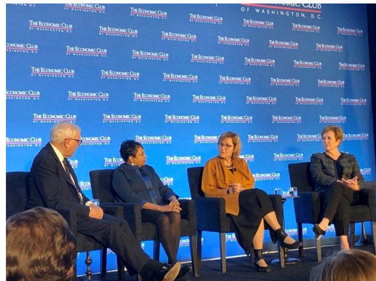
From left to right: Mr. David Rubenstein, Dr. Carla Hayden, Ms. Kaywin Feldman and Ms. Deborah Rutter at the Economic Club's cultural forum in Washington, D.C.

The National Gallery of Art, which Ms. Feldman has directed since 2008, aims to preserve, collect, exhibit and facilitate understanding of works of art in the United States at the highest level. Ms. Rutter, who took over as head of John F. Kennedy Center for the Performing Arts in 2014, serves as Curator of the Kennedy Presidential Memorial and Artistic and Administrative Director of the world's most active performing arts center. The first African American and first woman to become head of the National Library of Congress, Dr. Hayden was appointed to this prestigious position in 2016.