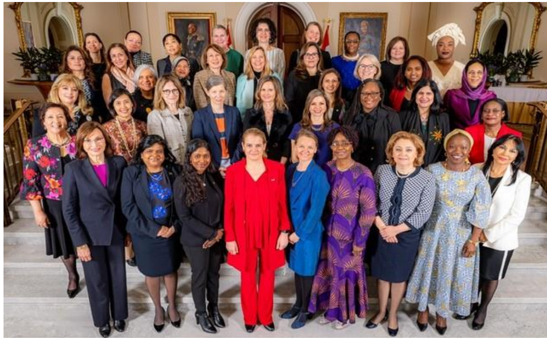
Above: Women diplomats accredited to Canada with Governor General Julie Payette (at front in red) at the annual diplomatic gathering in Ottawa in March 2020.

diplomatic representatives from countries of which the Queen is the Head of State, who are officially welcomed by the Prime Minister of Canada. The credentials ceremony is preceded by a ride on an Ottawa ice rink for new diplomats to experience the magic of Canadian winter. The following day, March 11, the Ambassador attended a luncheon hosted by the Governor General in honor of the approximately 40 female diplomats posted to Canada.