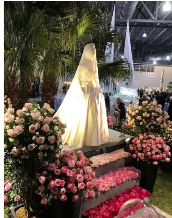
Above: Princess Grace Rose Garden pavilion illuminates the Philadelphia Flower Show.