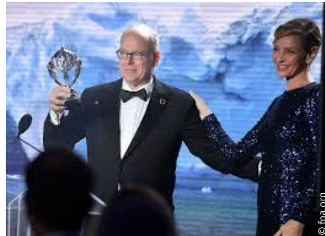
Above: H.S.H. Prince Albert receives the 2020 Lifetime Achievement Award from Ms. Uma Thurman (right) at the Hollywood for the Global Ocean Gala for planet and ocean conservation.

"I am deeply honored to receive this and to be welcomed at this exceptional event. The determination to act and the ambition to change the world with knowledge and intelligence are the most precious assets we have today," said Prince Albert at the ceremony.