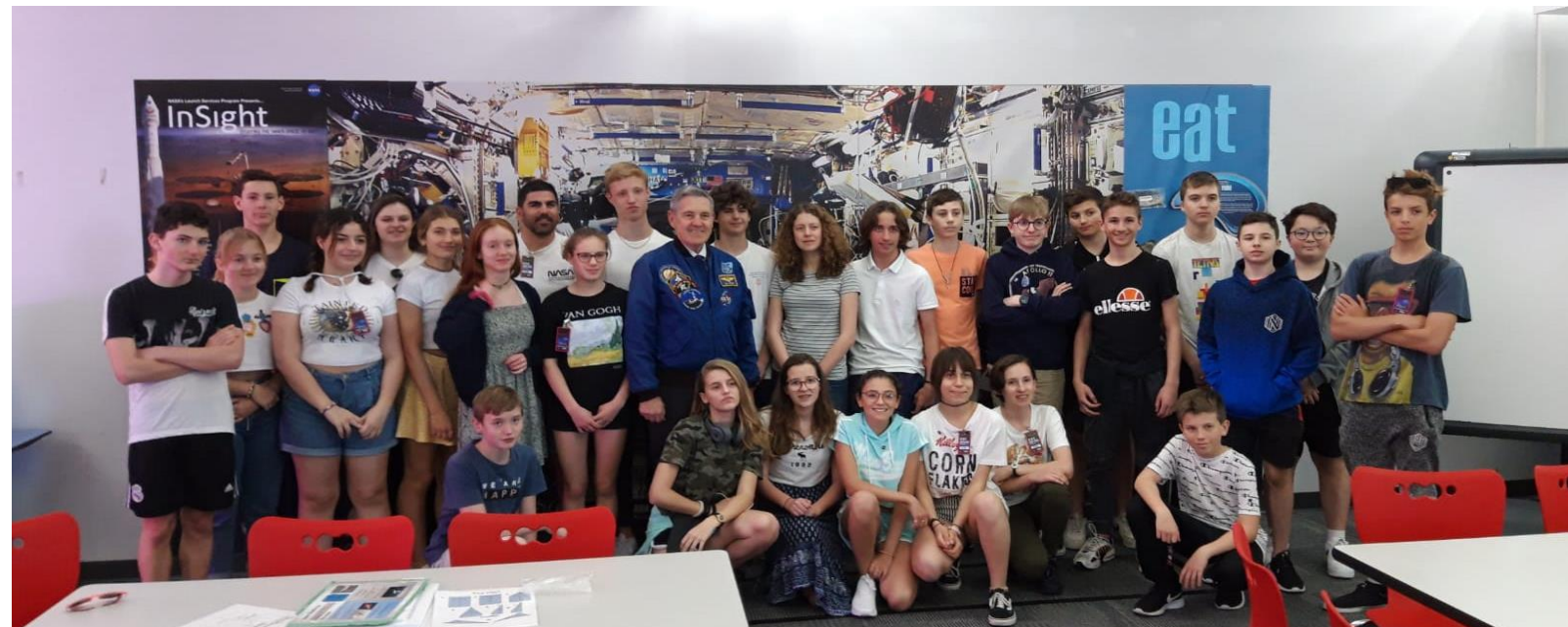
Above: High school students from the Charles III College of Monaco pose with Mr. Robert Cabana (center) at the Kennedy Space Center.