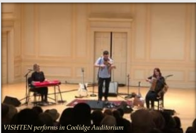
VISHTEN performs in Coolidge Auditorium