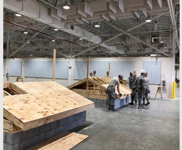
Naval Construction Battalion Center

From February 24th through 26th, the U.S. Department of State organized a trip to the Gulf Coast of southern state of Mississippi as part of its respected cultural and business program, “Experience America.” The program offered invaluable opportunities for Heads of Mission to meet well-established regional professionals in various economic, political, and scientific capacities, and entertained roughly 30 ambassadors over a three-day period.