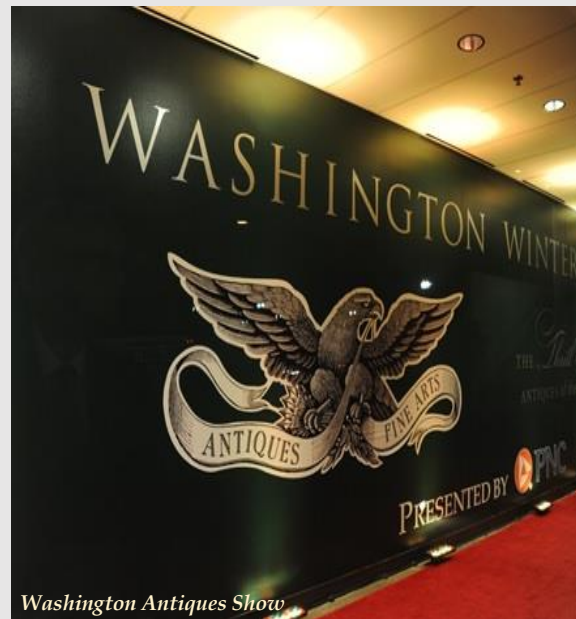
Washington Antiques Show

Created in 1955, this annual show, held between January 11th-13th, is one of the finest events of its kind in the United States. This year’s three-day event attracted more than 40 exhibitors from the United States and Europe. Since its creation, the event has raised more than $8.5 million, which have been donated to a variety of Washington D.C.-area charities that support children and low-income families in the region.