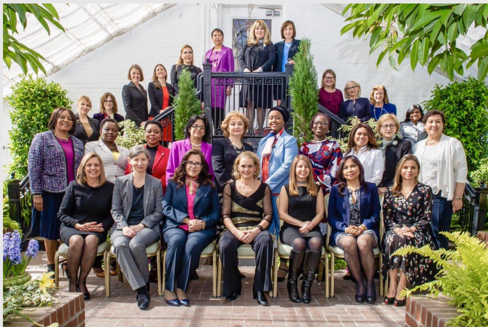
Center, first row: H.E. the Rt. Hon. Governor General of Canada, Julie Payette, is surrounded by the female Heads of Mission in Canada